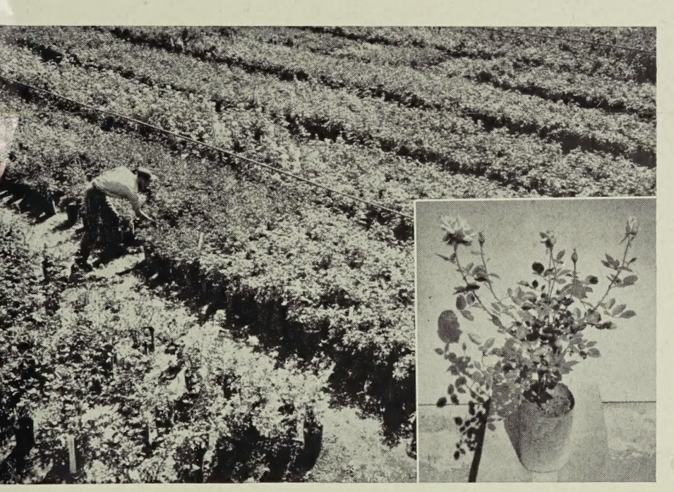
A fine block of Somerset Quality rose bushes potted for resale. These were potted in late March and grown outdoors with no protection other than temporary wind breaks the first few weeks.

Proper storage, good packing, and all the other little things that add up to make our roses equal to the best.